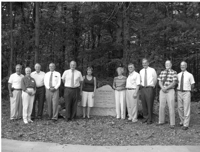
The Gregg Family Dedication & Recognition

It was a picture-perfect day on October 6, 2007 when the Dunstable Rural Land Trust formally recognized the contributions of sixty acres of land to the Trust. The ceremony took place on Main Street near Gregg Road on land donated by the Gregg Family. Approximately fifty people attended the ceremony, including the Gregg family (Catherine Gregg, Cy and Joyce Gregg, and United States Senator Judd Gregg), as well as trustees and friends of the Dunstable Rural Land Trust and the Gregg family.